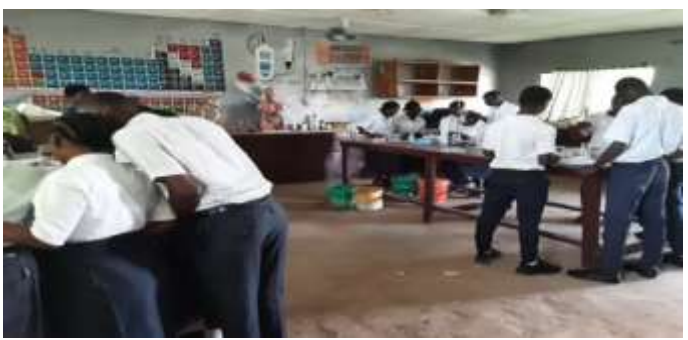
Figure 2. Students working in cooperative groups